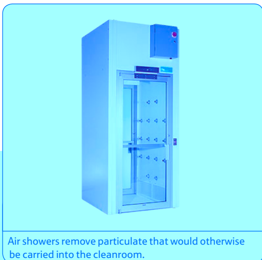
Air showers remove particulate that would otherwise be carried into the cleanroom.

In an air shower, a worker passes through the entry door and a sensor activates interlock magnets, which lock the air shower and cleanroom doors. Numerous adjustable nozzles