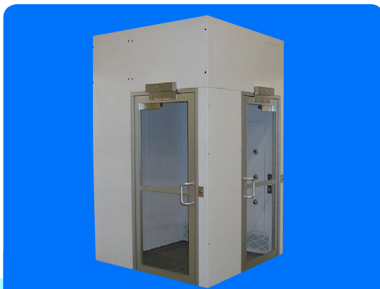
Clean Air Products offers a full range of air shower configurations.