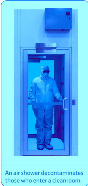
An air shower decontaminates those who enter a cleanroom.

blow high-velocity streams of Class 100 filtered air onto workers. The high-velocity air creates a flapping effect on clothing which produces a scrubbing action, removing particulates from cleanroom garments. To ensure all particulates are removed, workers raise their arms and rotate in place.