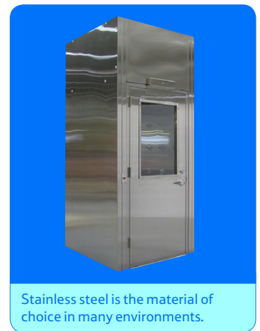
Stainless steel is the material of choice in many environments.

Some manufacturers offer economy units made of laminated particleboard. This option has major weaknesses, though. Temperature and humidity fluctuations can cause delamination. The materials are easy to damage and susceptible to joint loosening. Any of these conditions may generate particulate or biological contamination.