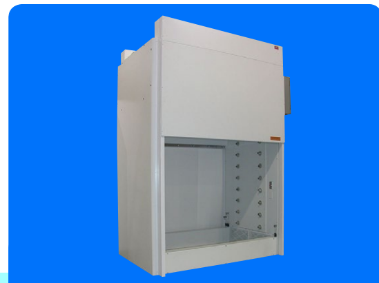
Parts-cleaning air showers can be part of a complete cleanroom system.